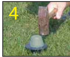
4 Using rubber mallet or hammer, tap socket setter until ground socket is at turf surface.

SAFETY: Inground products are made of soft pliable polymers. Above ground products won't crack, splinter or have sharp edges. Exclusive "Hide-away" spike stores inside poles when not in use.