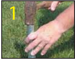
1 Drive installation tool into ground with hammer at starting point.

Here is a step-by-step guide to eliminate repeated measuring and staking. From now on, just connect the dots.