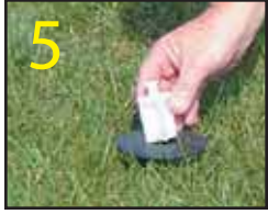
5 Insert lining peg into ground socket.

CONVENIENCE: Quick set-up & teardown. Lightweight, durable products.