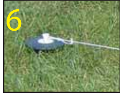
6 Attach string to lining peg and extend to next point. Now you can paint lines. Remove lining peg and string upon completion.