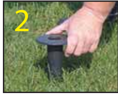
2 Place ground socket into hole.