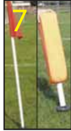
7 Insert Game Day flags or pylons