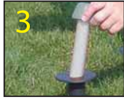
3 Insert socket setter into ground socket.