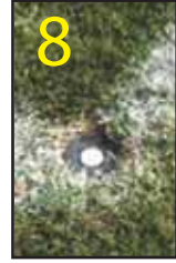
8 Insert plugs into all empty sockets.